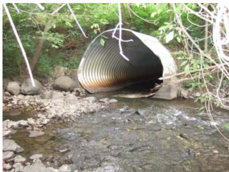
Culvert Downstream of Monitoring Site (directs Creek to confluence with Mohawk River)