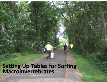
Setting Up Tables for Sorting Macroinvertebrates