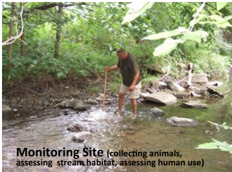
Monitoring Site (collecting animals, assessing stream habitat, assessing human use)